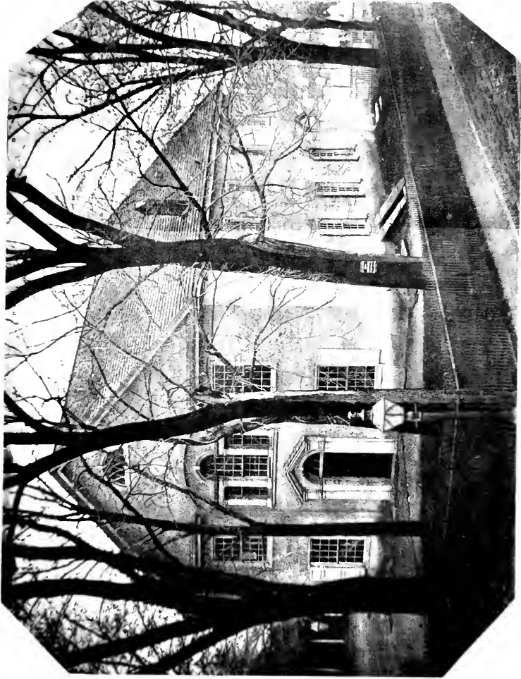
PRESBYTERIAN CHURCH OF FRANKFORD, AS IT WAS.